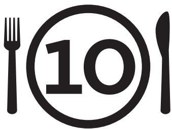
Table for Ten