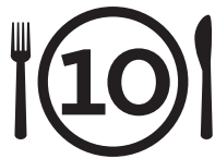
Table for Ten